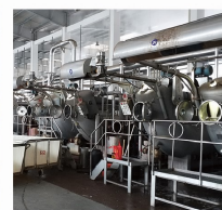
06 染色 Dyeing