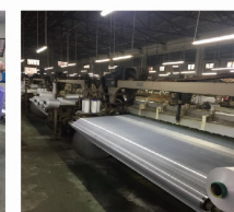
04 织造 Weaving