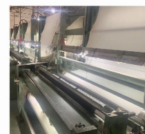
05 割绒 Pile Cutting