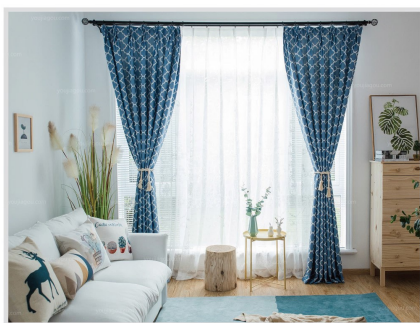
窗帘面料 Curtain Fabric