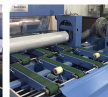
08 包装 Auto Packing