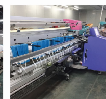
03 穿综 Drawing-in