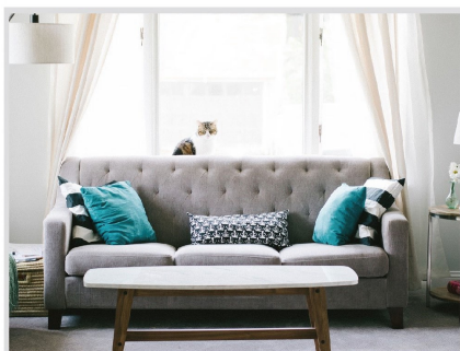
沙发面料 Sofa Fabric

We offer our customers fabrics including sofa fabric, bedding fabric, curtain fabric, apparel fabric, from grey fabric dyed and printed, bronzed, embroidered, punched and bonded and so on, a series of treatment processing service.