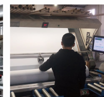
07 检验 Inspection