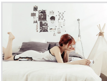
床品面料 Bedding Fabric