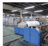
02 整经 Warping