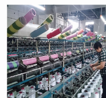
01 并网 Yarn Combination

并网-整经-穿综-织造-割绒-染色-检验-包装 YARN COMBINATION-WARPING-DRAWING-IN-WEAVING- PILE CUTTING-DYEING-INSPECTION-AUTO PACKING